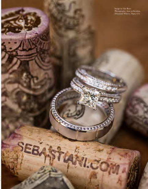
shot on location, Sebastiani Winery, Napa, CA.

P.S. Are you a little stressed planning your wedding? If yes, be sure to read the article, "How a wedding coordinator can save your sanity" on page 12. Planning your wedding should be fun, not stressful.