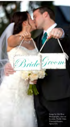
shot on location, Pacific Oaks Winery Estates, Napa, CA.